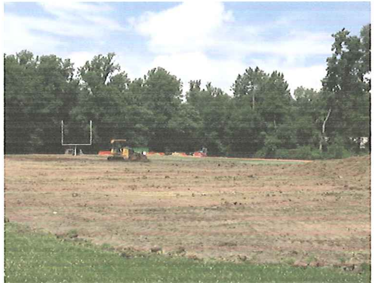
Stripping of Topsoil on Stadium Field