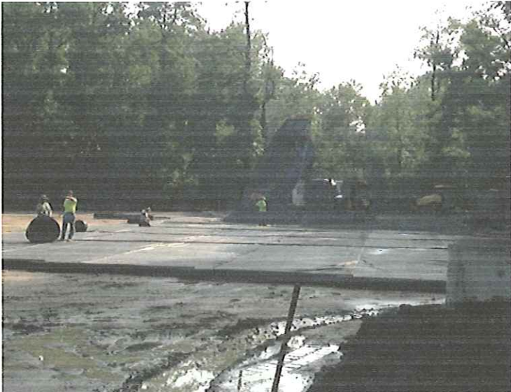
Installation of Filter Fabric, Underdrain and Coarse Stone Layer on Anniversary Field

Work was completed on the installation of underdrain pipe and structures on Anniversary Field. Installation of filter fabric, underdrain, field drain coarse stone and perimeter curb for the field began. A subcontractor bored pipe underneath the track to connect the drainage systems between the two fields, and the Contractor began work on Stadium Field by stripping topsoil.