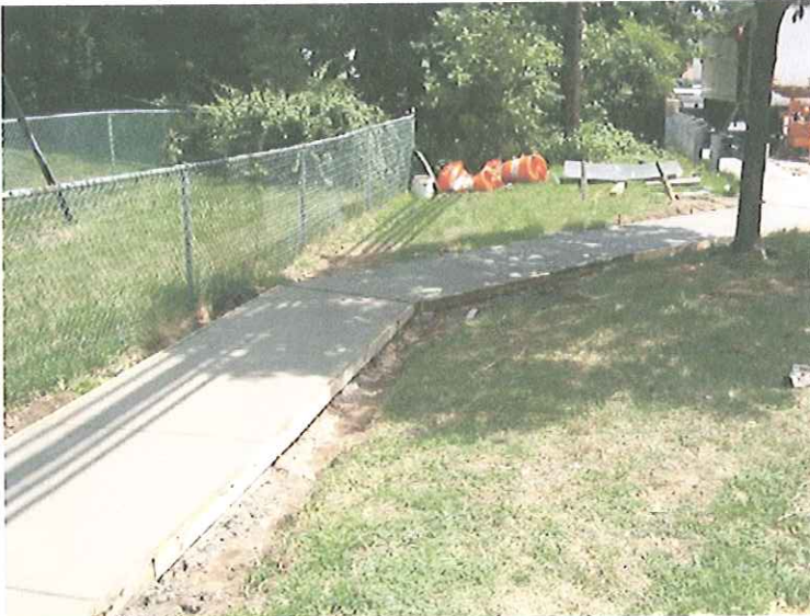
Sidewalk Construction Along Ellis Street Adjacent to HLL Fields

The installation of sections of new water main and sanitary sewer main repairs were completed. Curb work along Ellis and Potter Streets was completed with sidewalk installation along both streets and driveway apron replacement on Potter Street commencing. The lowering of MacDonald Park to rough grade was completed including excavation of pending retaining wall, and construction of the wall on Potter adjacent to the Haddonfield Little League fields began.