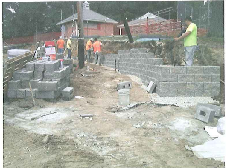
Retaining Wall Construction On Potter St. Adjacent to HLL Fields