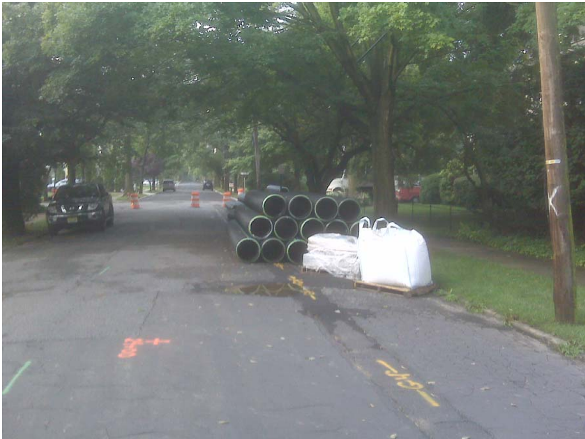
18" Diameter Plastic Storm Sewer Pipe Waiting to be Installed

The project consists of the reconstruction of Chestnut Street from Lincoln Avenue to East Park Avenue and it completes the work started last year on the section of Chestnut Street from East Park Avenue to Reillywood Avenue. This project, which is partially funded by the Federal Highway Administration and the New Jersey Department of Transportation, required extensive review and approval by both funding agencies; therefore it was necessary to start this phase of the project as part of the 2009 Road Program.