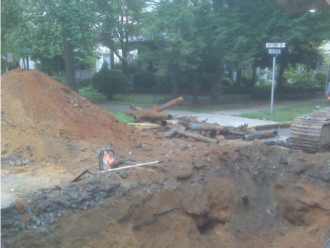
The Remains of the Old Cast-Iron Water Main Pipe Removed From the Intersection

Upon completion and acceptance of all of the proposed utility replacement work, the Borough will install the new concrete raised intersection with brick paver crosswalks and curb extensions and will replace the existing concrete curbing and driveway aprons, reset the existing slate curbing and brick sidewalks. Once all of that work is complete, the Borough will then begin the complete reconstruction of the asphalt pavement in the project area. Although, the project completion is dependent upon the weather and the final approval from the funding agencies, every effort will be made to have a majority of the work near the adjacent Central Elementary and Haddonfield Middle School complete by the start of the 2009 – 2010 School Year. In order to meet this deadline, the Chestnut Street and Lincoln Avenue intersection will be closed to traffic until the work in the intersection is completed.