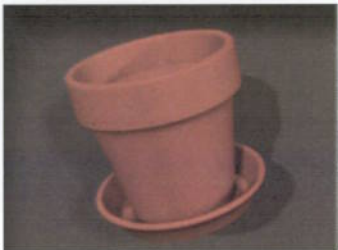
In Flower Pot Dishes