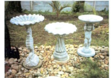
In Bird Baths