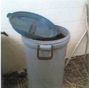
In Trash Cans and Trash Can Lids

IT TAKES ABOUT ONE WEEK FOR A MOSQUITO TO GROW FROM EGG TO ADULT