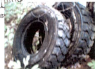
In Unused Tires