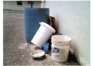
In Open Containers