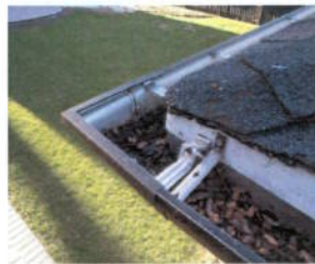
In Clogged Gutters