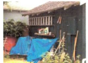
In Unused or Draped Tarps

Help us help you by eliminating standing water after EVERY rain!!