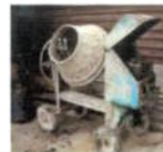
In Wheel Barrels and Mixers