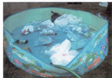
In Unused Swimming Pools